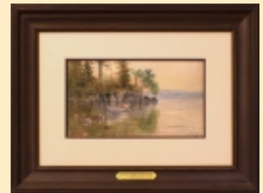
Cozy Nook Hood Canal, 1891