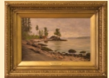
Hood Canal: WA 1891