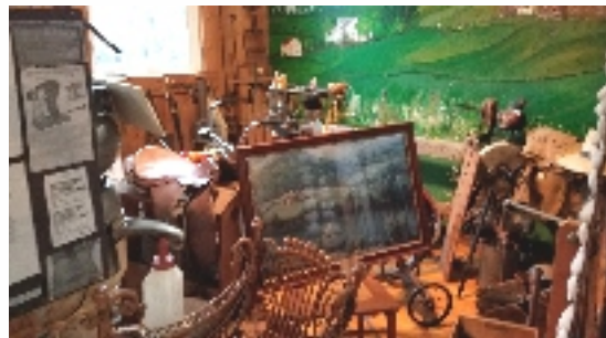
▲ Before & After! ▼

We are excited about these long overdue investments into the heart and soul of our enterprise.